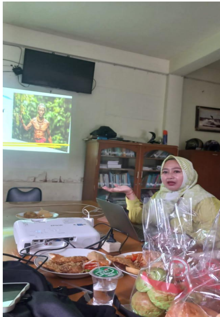
Figure 2. Presenter

This training activity was carried out at the Citra Mandiri Foundation (YCM) from February 22, 2025 to August 22, 2025. This creative training activity increases the capacity of local communities, especially the younger generation and cultural actors, in repackaging Mentawai customary knowledge in an interesting and relevant way through various educational and socialization media. The goal is that the cultural values contained in Mentawai customs are not only preserved from generation to generation, but can also be understood, appreciated, and disseminated to the wider community in a more modern and communicative form.