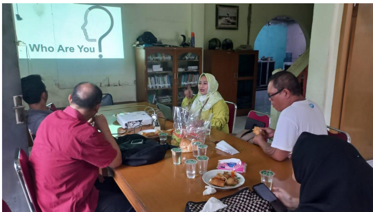
Figure 3. Discussion of Figures, Speakers and Youth Groups